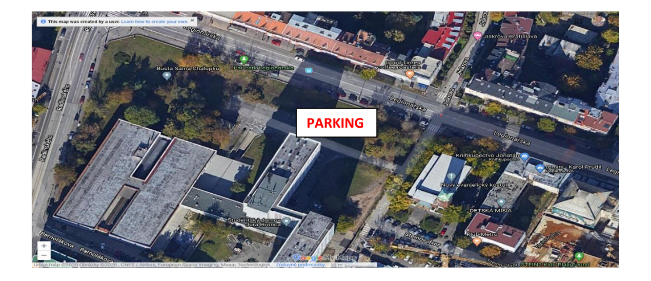
Fig. 1 Departure of the bus will be from Legionárska street, behind the SD Jura Hronca (a big parking lot)

The Student has to have the upper respiratory tract/organ covered and come at least 30 minutes before the bus departure. If the student misses the booked bus, he/she has to come to UZ Gabčíkovo by her/his way.