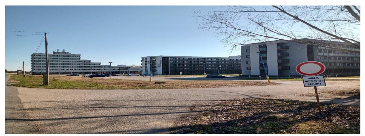
Fig. 2 UZ Gabčíkovo