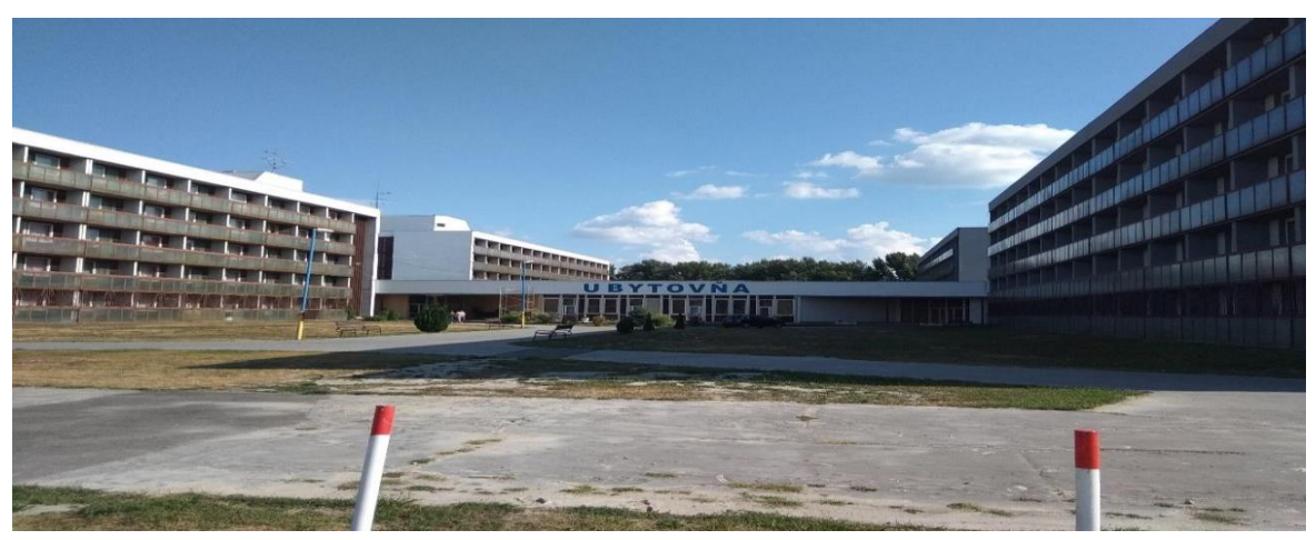
Fig. 3 UZ Gabčíkovo Reception

6. Transport connection Bratislava - Gabčíkovo: https://www.sadds.sk/sk/cestovny-poriadok