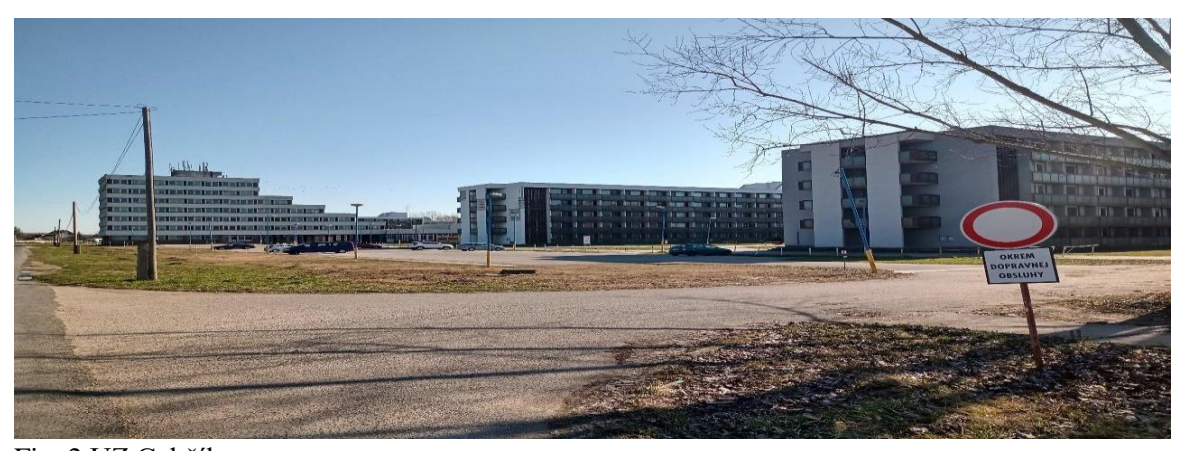
Fig. 2 UZ Gabčíkovo

Reception of UZ Gabcikovo will be open from 7.9.2020 till 16.9.2020 from 8:00 am till 8:00 pm.