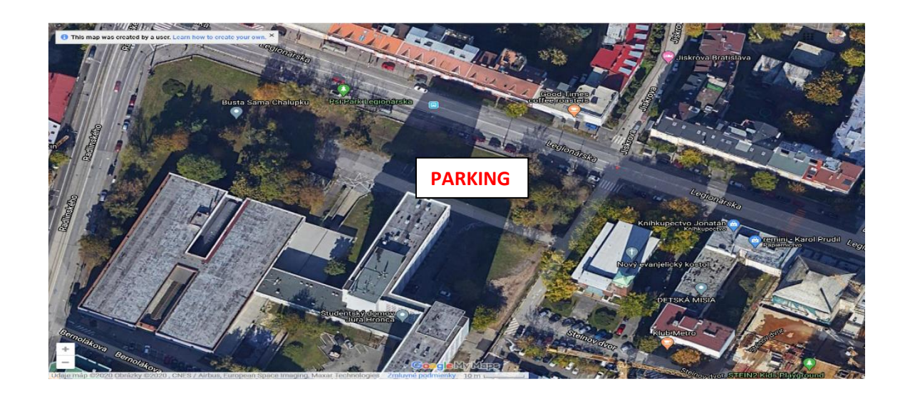
Fig. 1 Departure of the bus will be from Legionárska street, behind the SD Jura Hronca (a big parking lot)