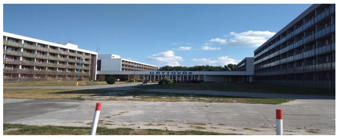
Fig. 3 UZ Gabčíkovo Reception