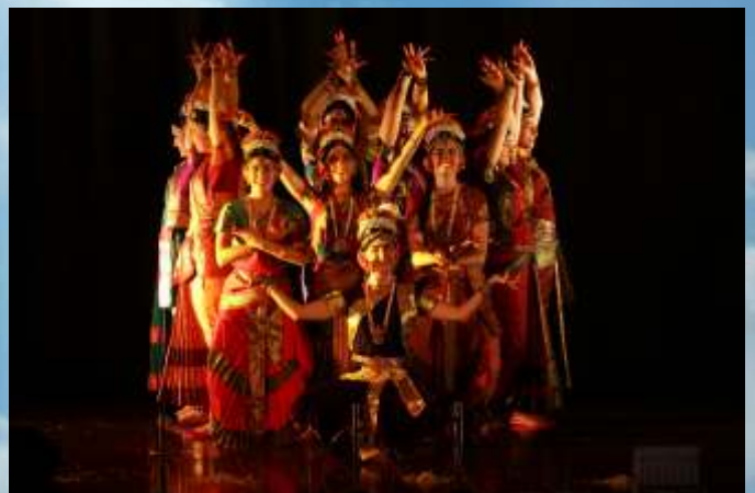
Cultural Evening, Quiz and Storytelling Sessions