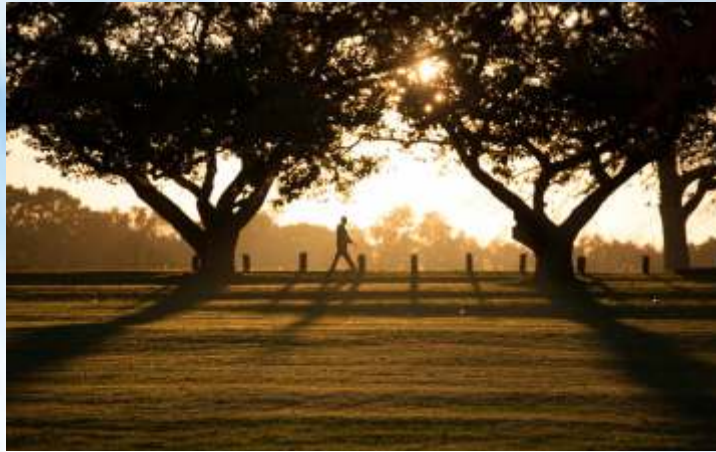
Morning Walk, Yoga, Meditation