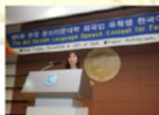
Korean language speech contest