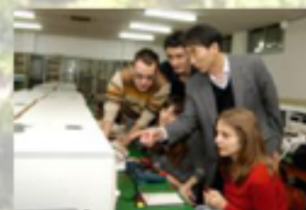
Major course study

* Note: Currency rate (as of Oct. 26, 2012): EUR 1 = KRW 1417.98, Tuition fees can be changed according to the college policy.