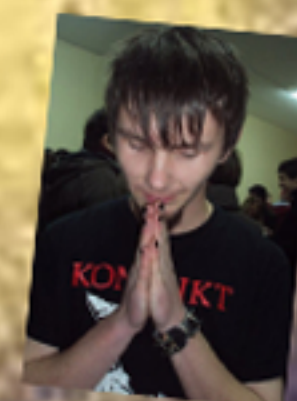
a mne je tu dobre...