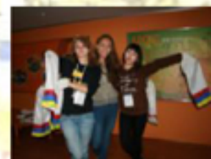
Korean culture experience