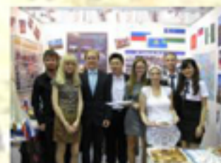
“Feel the diversity” college exhibition