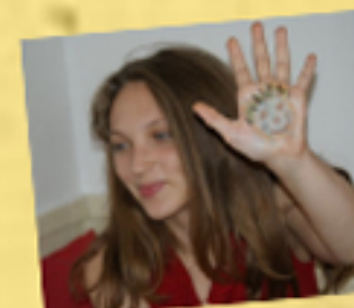
dávam 5 bodov z piatich :)