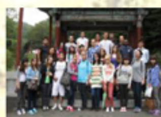
Trip to cultural sites

Ak tá tento program zaujal a chceš získať