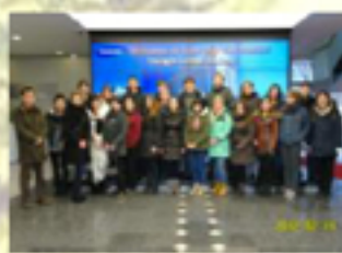
Visiting Samsung Digital City