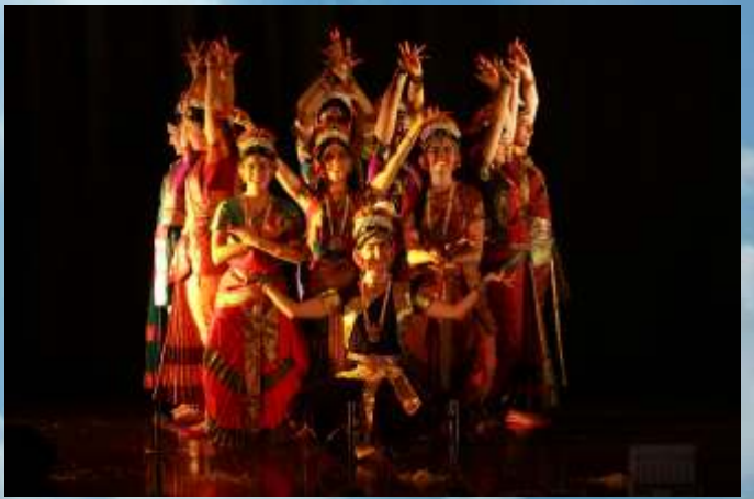
Cultural Evening, Quiz and Storytelling Sessions