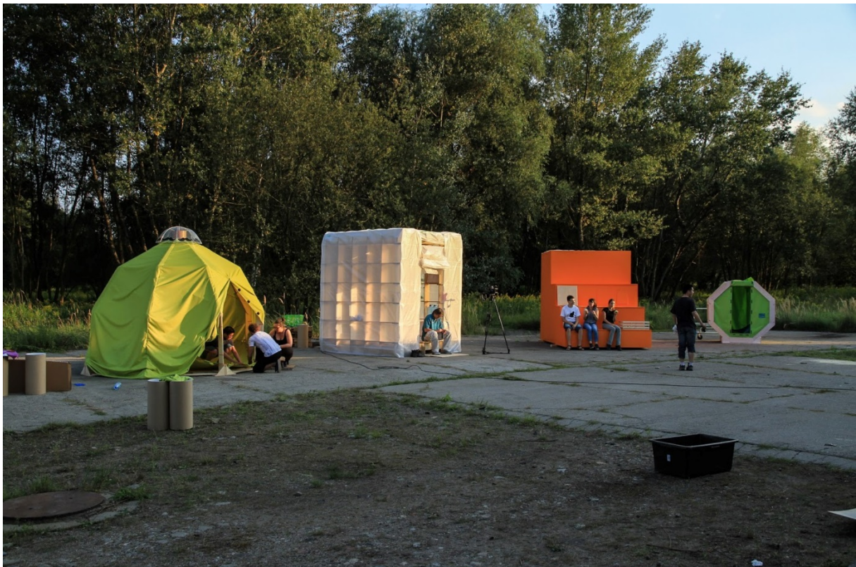
results of Summer School of Architecture 2016

For more information or questions do not hesitate to contact with us at: www.ssa.pwr.edu.pl | info@ssa.pwr.edu.pl | +48 605 606 880