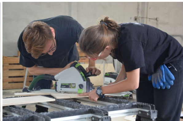
Students are working with the tools to construct their projects of Living Units, Summer School of Architecture 2016